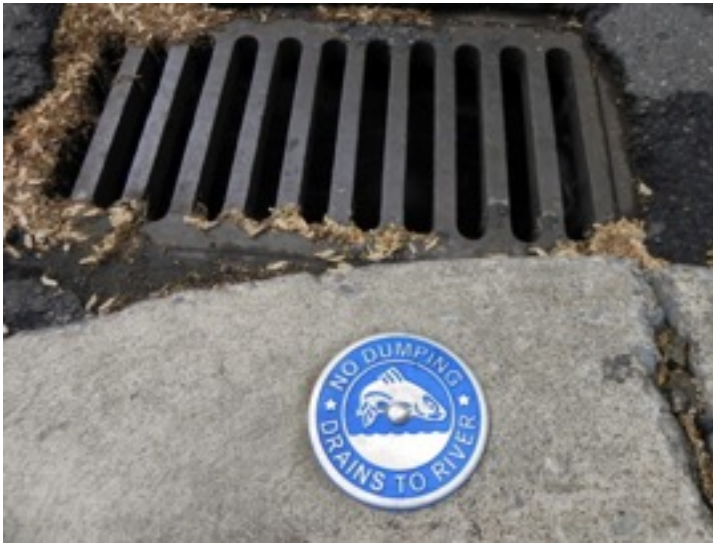
Photo of the top of a catch basin.