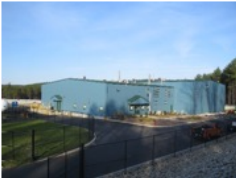
This is a photo of the Northampton Water Treatment Plant.