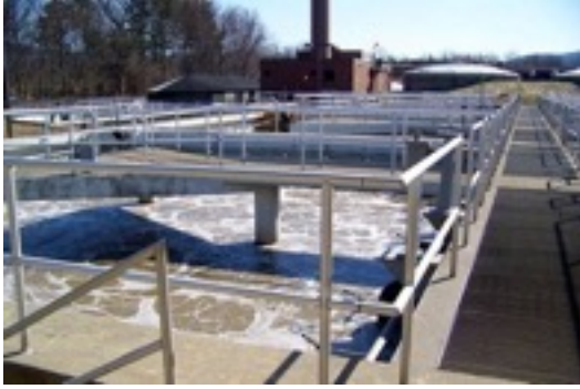
This is a photo of the Northampton Wastewater Treatment Facility.