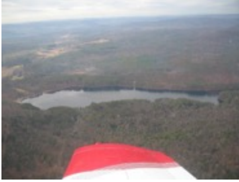
This is a photo of Ryan Reservoir - one of the City's largest reservoirs.