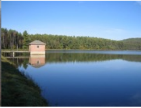
This is Mountain Street Reservoir